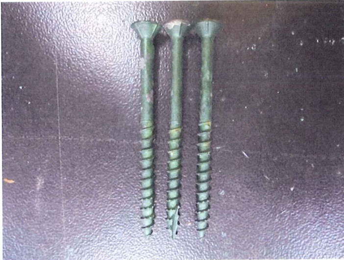
Fig. 3 : After 20 cycles(After test)