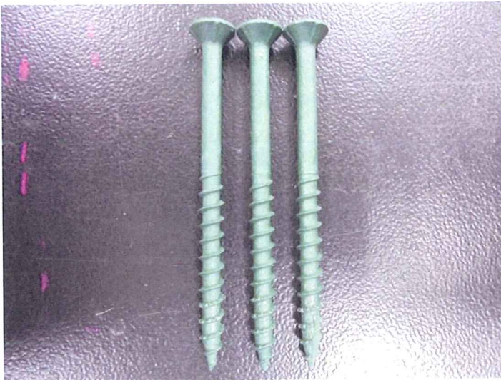
Fig. 1 : Before test