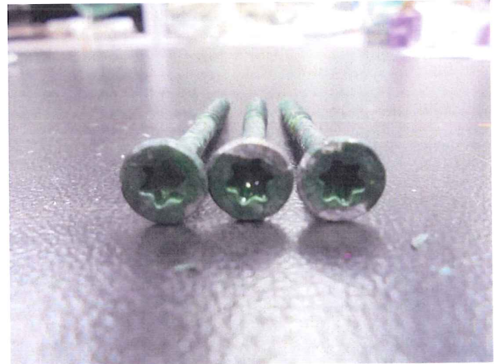
Fig. 4 : After 20 cycles(After test)